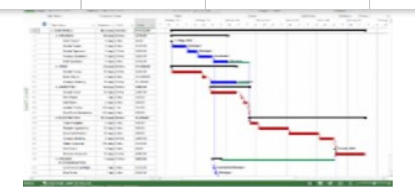
Float? Slack? Free and Total!